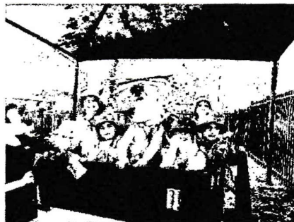
Pre-schoolers on the 1920s Menai cart