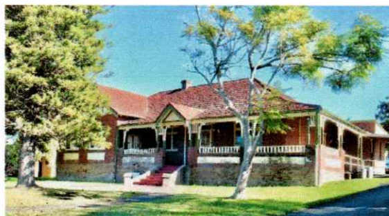
Hotham House in 2023

Hotham House built in 1912, was the residence of a very successful poultry farm and has been a Gymea landmark for more than a century.