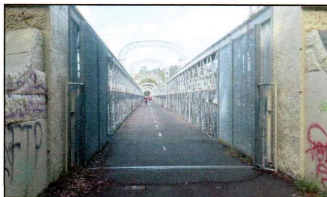
Como Bridge – now a walking bridge

Change is inevitable! Some is for the better, some not. It can be controversial. These are just a sample of changes over time to the Sutherland Shire you will find on display at Sutherland Shire Museum.